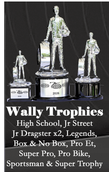
Wally Trophies High School, Jr Street Jr Dragster x2, Legends, Box & No Box, Pro Et, Super Pro, Pro Bike, Sportsman & Super Trophy